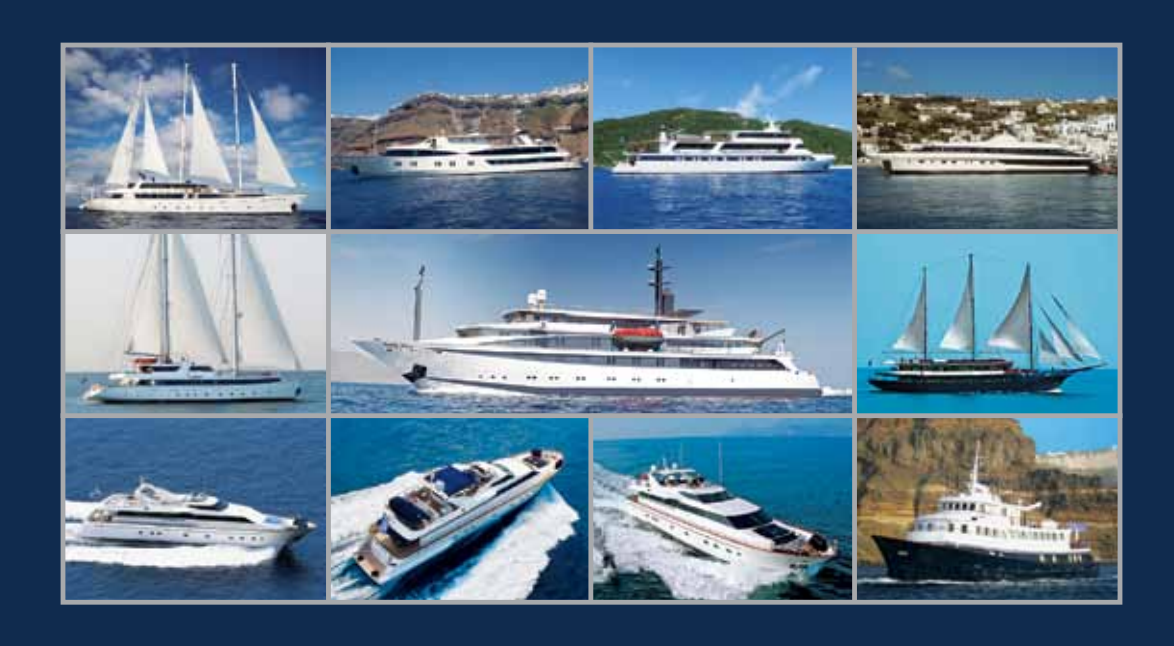
The Variety Cruises Small Ships